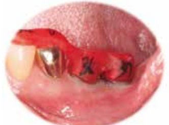
SMARTFIT connected w/ jig