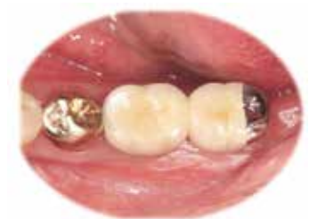
Final crown connected

To order a SMARTFIT custom abutment, please contact your local sales representative or the SMARTfit department: