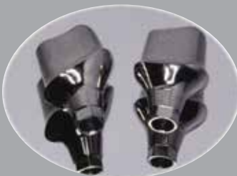
Milled SMARTFIT custom abutment