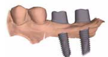
SMARTFIT custom abutment design