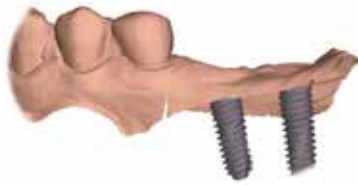
3D Scanned image