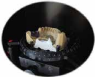
Digital Scan of working model