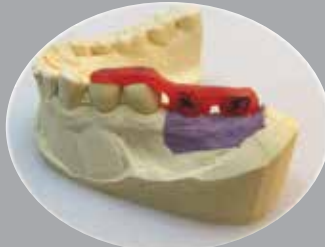
SMARTFIT w/ a jig